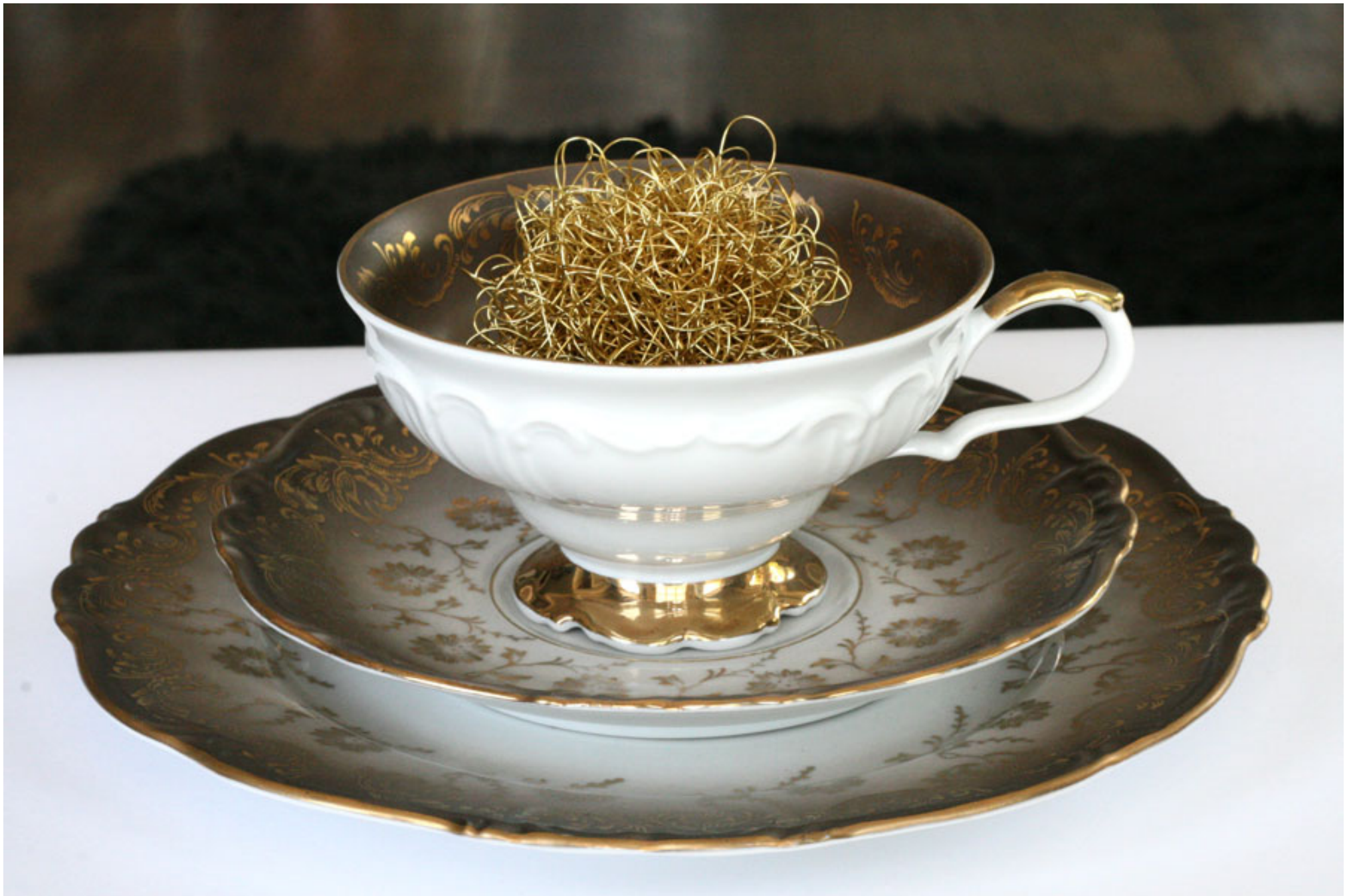
Großmutter, 2012, Bavarian China, Gold Wire (180'), 3x8x8"