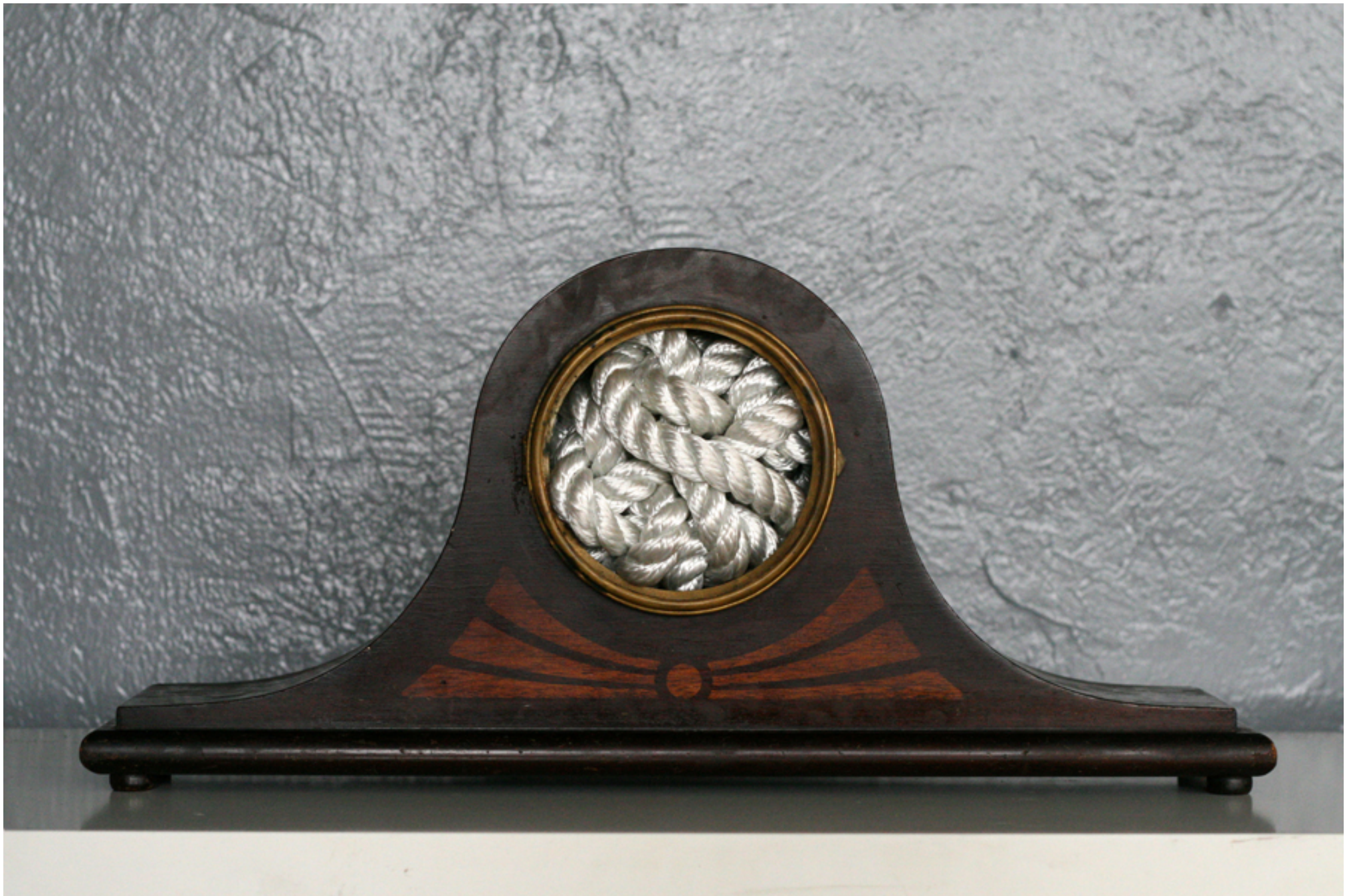
Leola Greer, 2012, Wood, Brass and Rope, 10x4x22"