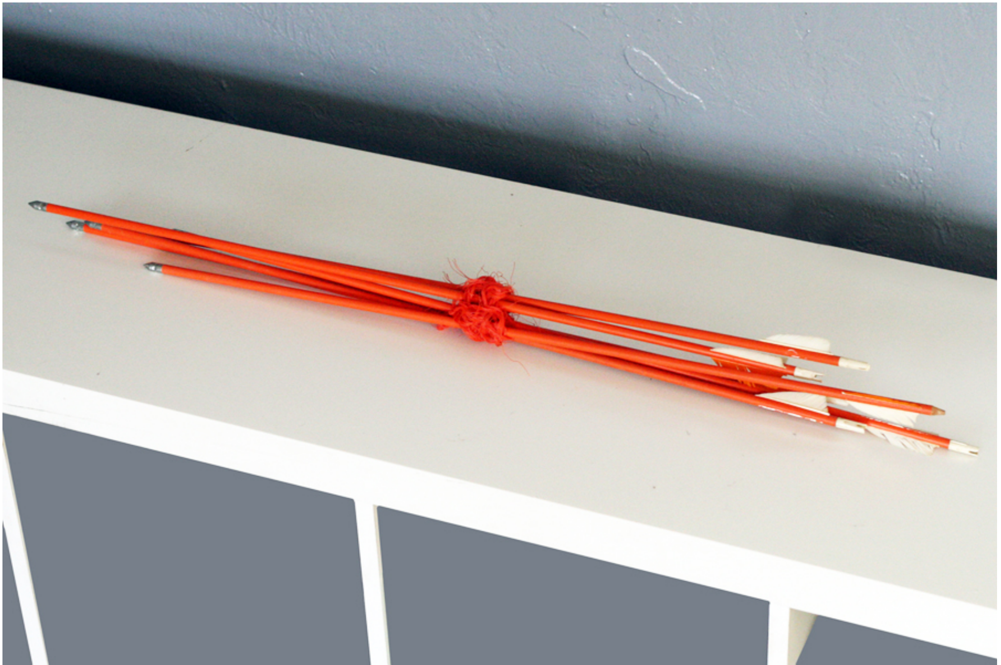
Sivells (orange), 2012, Arrows, Rope, 2x36x2"