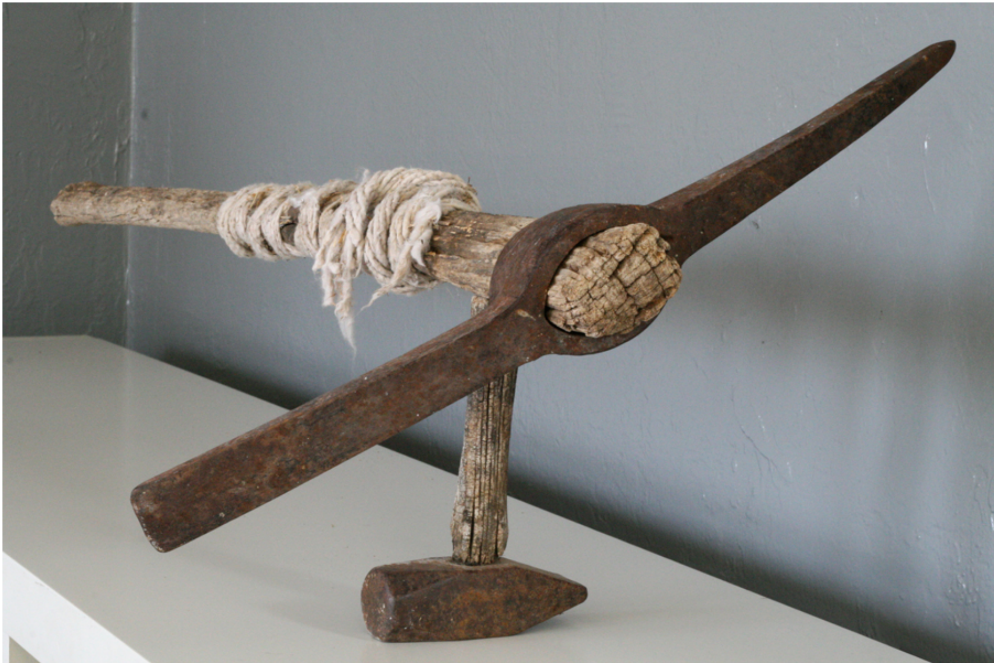
American Gothic, 2012, Pickaxe, Hammer and Rope, 20x36x15"