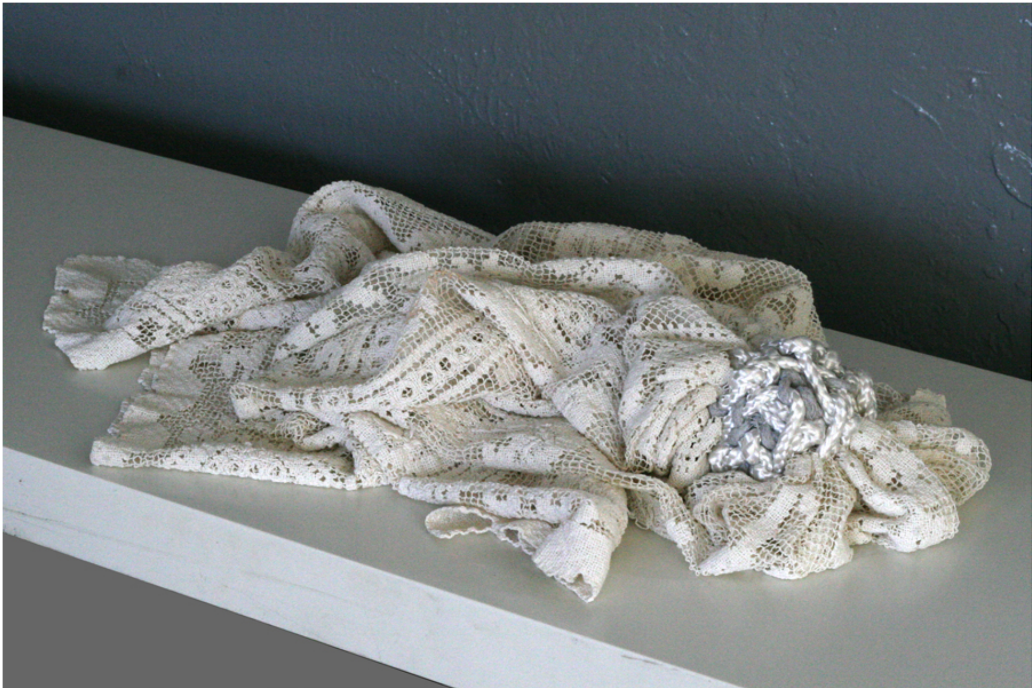
Edith, 2012, Lace Tablecloth, Cord, 4x26x9"