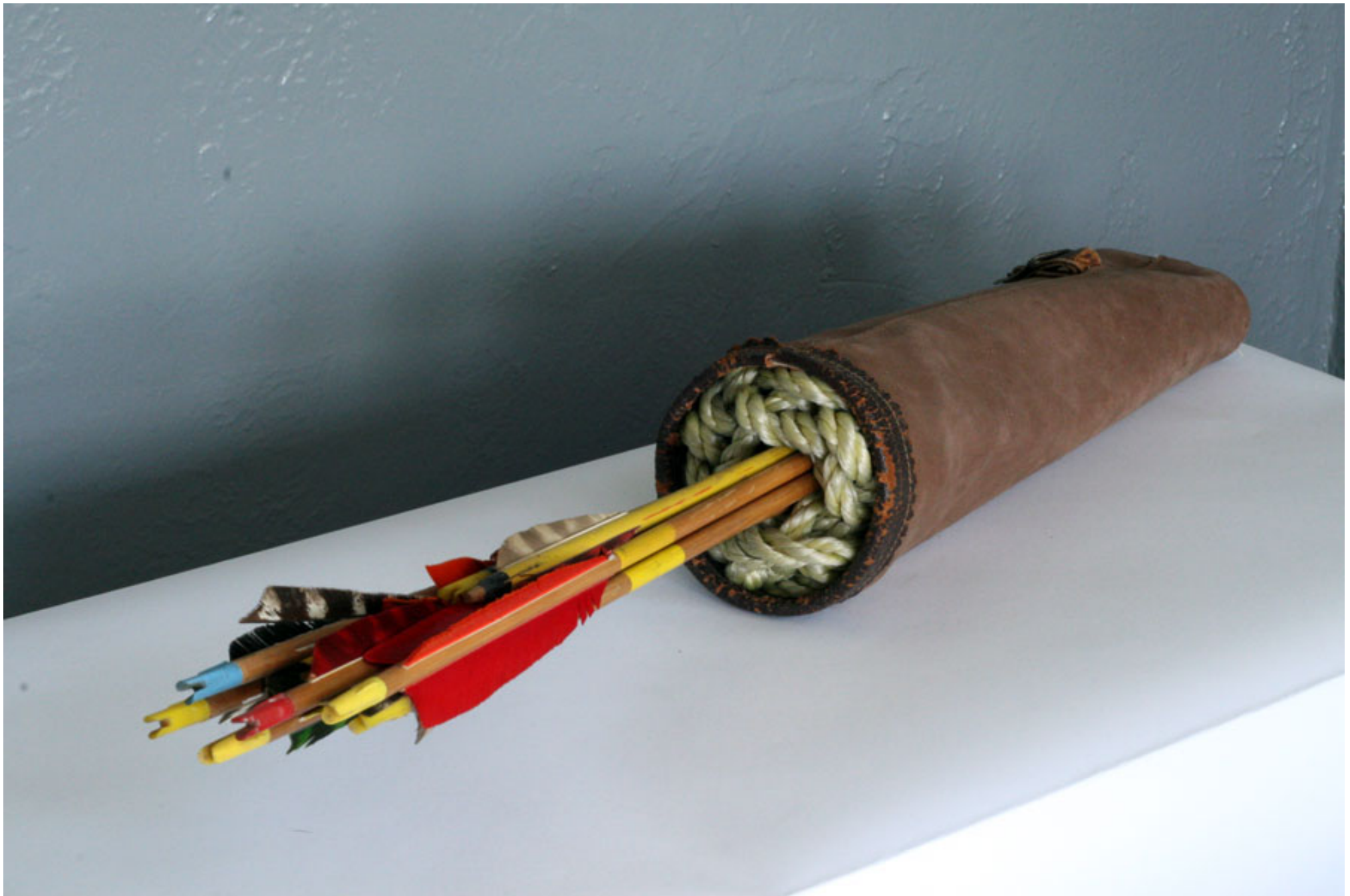
Sivells, 2012, Arrows, Rope and Leather, 4x30x4"