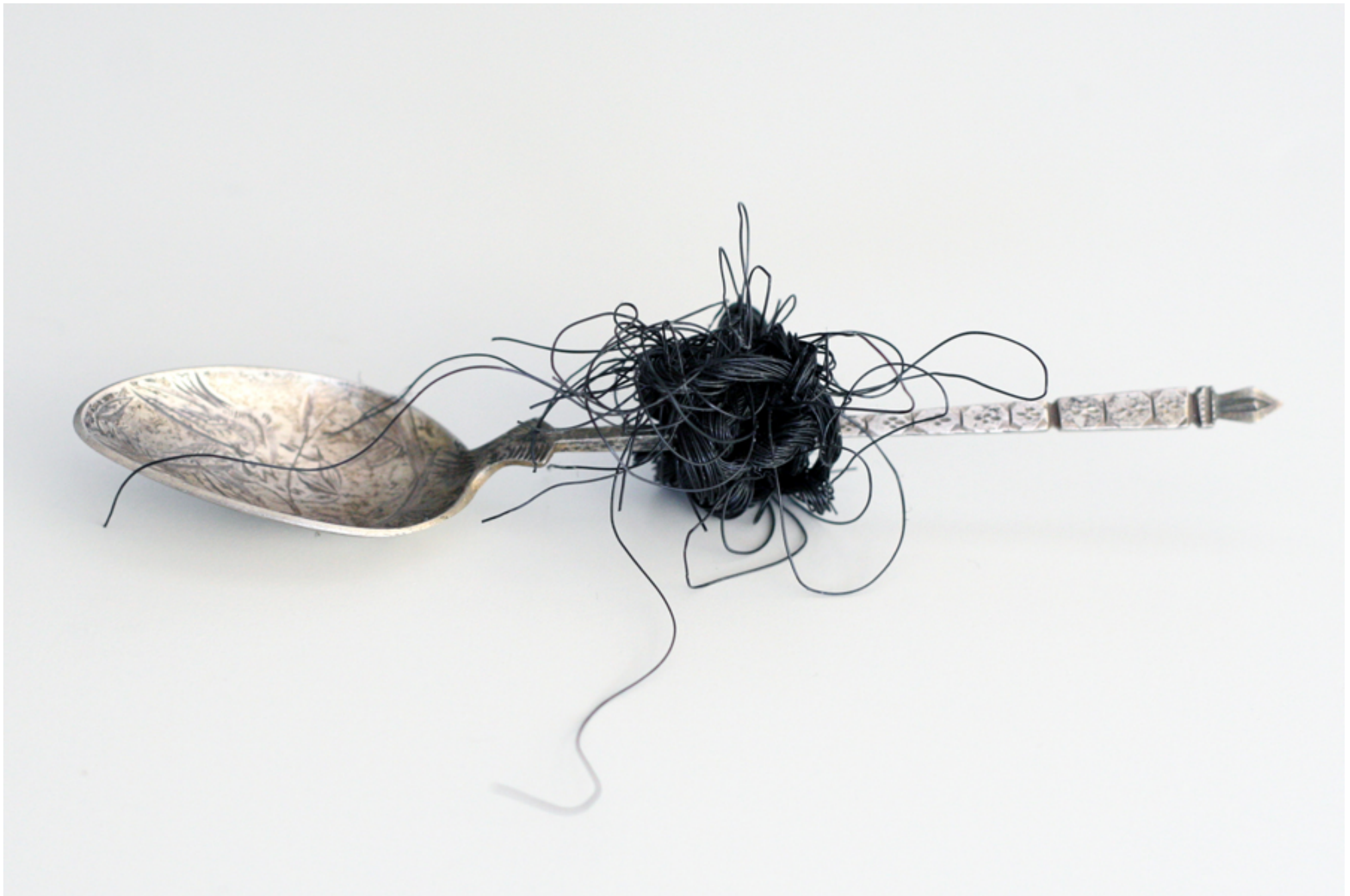
Lilth, 2012, Silver Spoon, Rope (500'), 1x6x1"