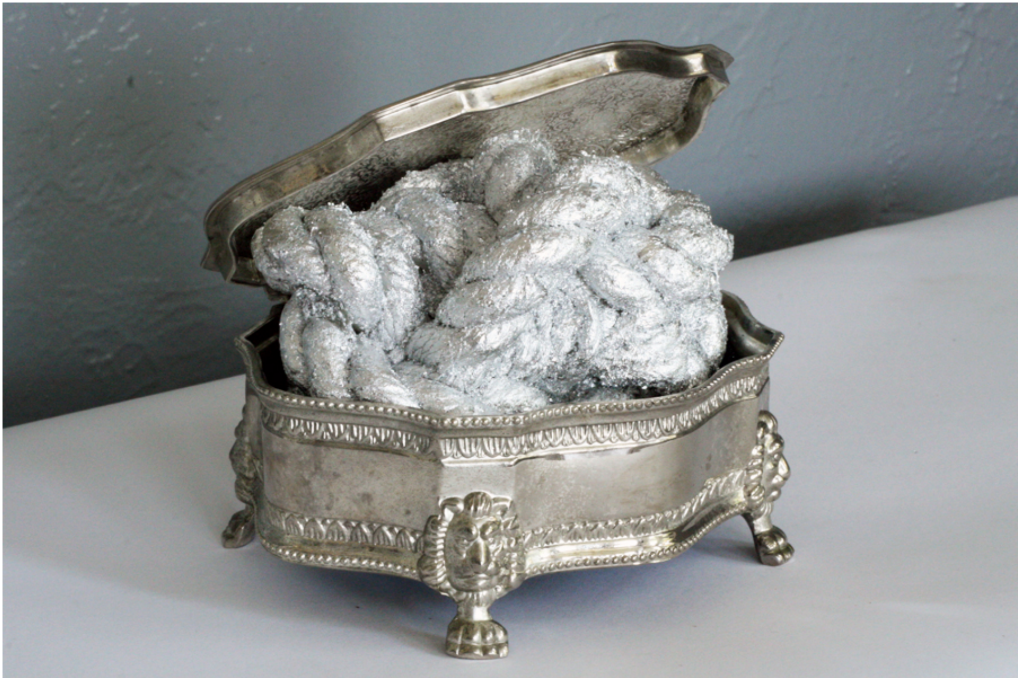
Twenty Fifth, 2012, Silver Keepsake Box, Silver Leaf and Rope, 9x9x6"